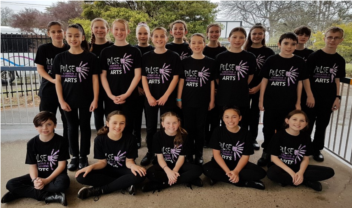
The 2019 Pulse Choir